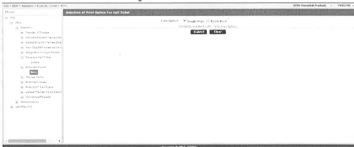
Figure 17: Print Hall Ticket - Create